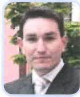
Alen Leveric Deputy Minister of Economy, Croatia

With Albania opening up 13 blocks for exploration, Croatia having succeeded in securing top oil operators for their offshore blocks, Montenegro deciding on the open door results, and Greece a step away from closing their licensing round, you will benefit from the latest and exclusive coverage of developments in the region.