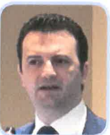
Dorian Duka Deputy Minister of Energy and Industry, Albania