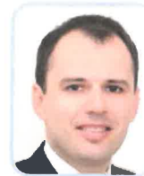
Reuf Bajrović Federal Minister of Energy, Mining and Industry, Bosnia & Herzegovina