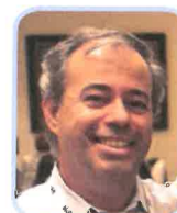
Spyros Bellas Principal Geologist, Ministry of Reconstruction of Production, Environment & Energy, Greece